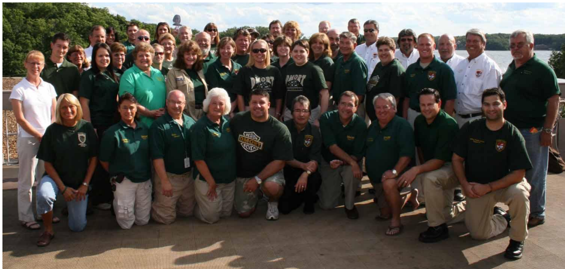
DMORT 7 Lake of the Ozarks, Missouri July 21, 2009