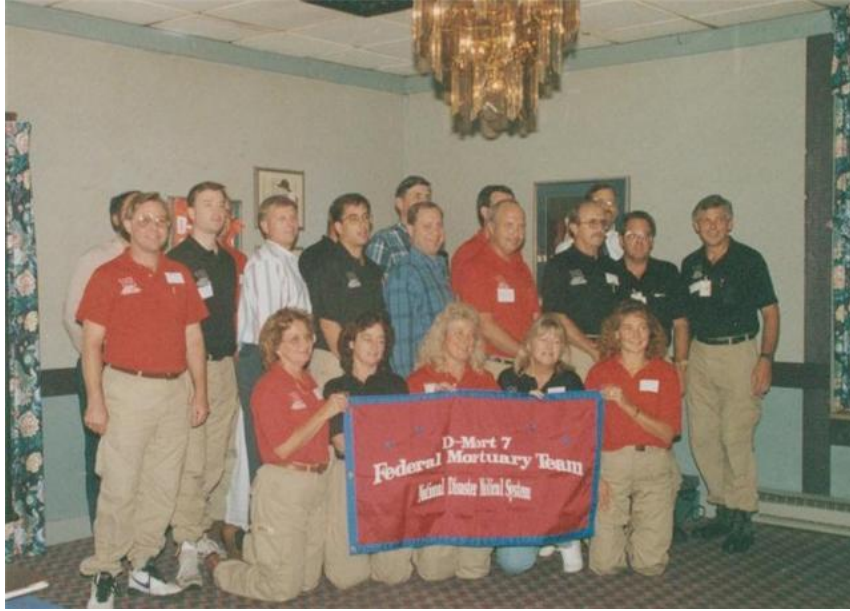
Does anyone know the date and location of this photo?